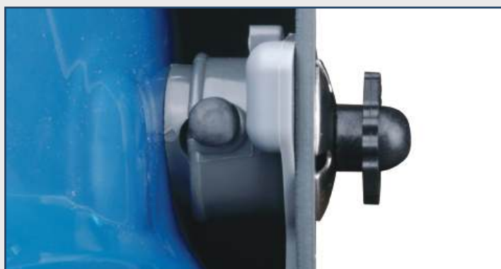
One-Clip connecting system Reliable Up & Down shift